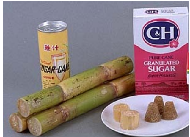
Sugar cane →

In 1835, people began growing sugar cane . People came from Asia and other areas to work. That is why Hawaii has so many different kinds of people today.