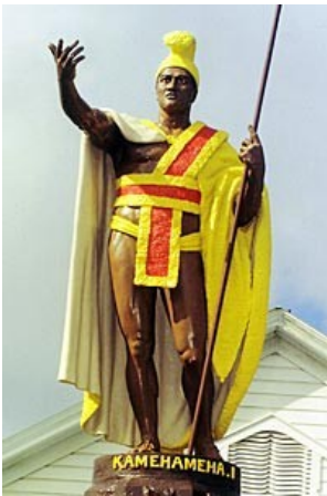
← King Kamehameha

Captain James Cook came to the islands in 1778. Then, King Kamehameha united the islands.