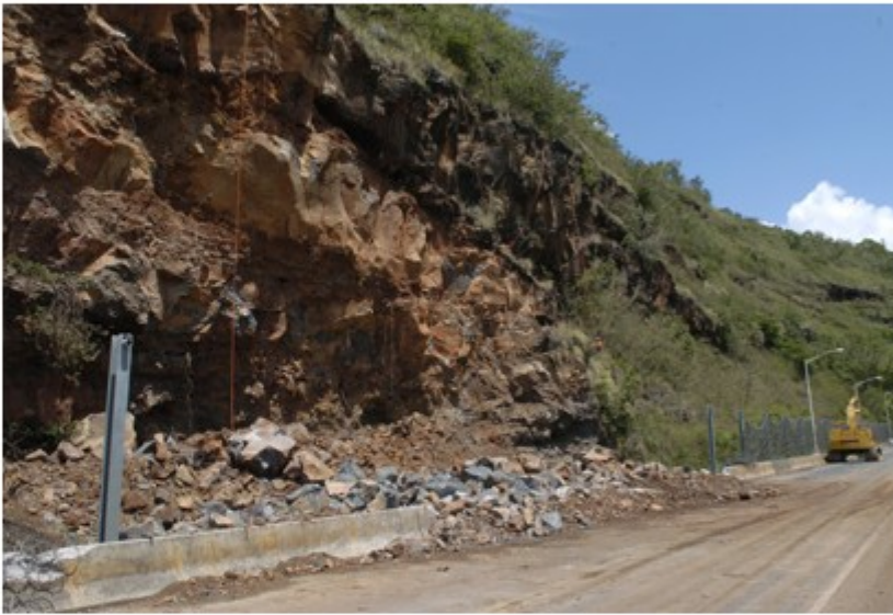
A rockslide rumbled onto Kamehameha Highway in Waimea, keeping the road close in both directions until the boulders were cleared.