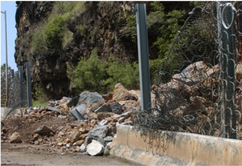
A metal fence helped keep some boulders from spilling onto the road.